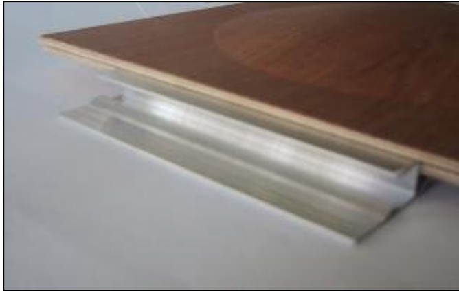
Dual Connection Fitting