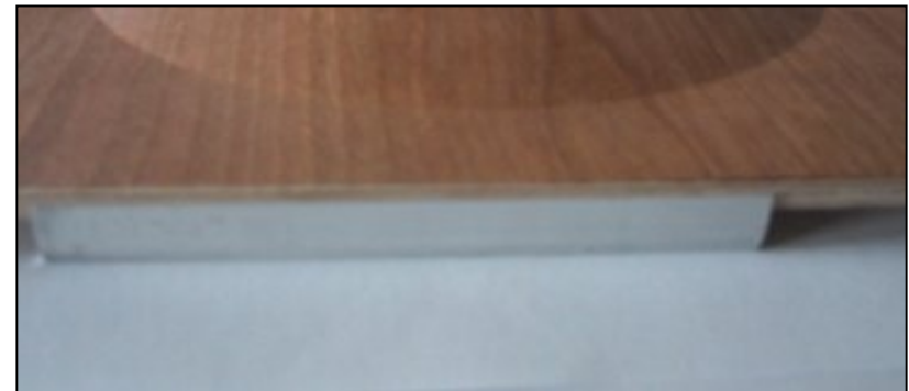
POP Panel Installation Fittings Soft Aluminum Extrusions